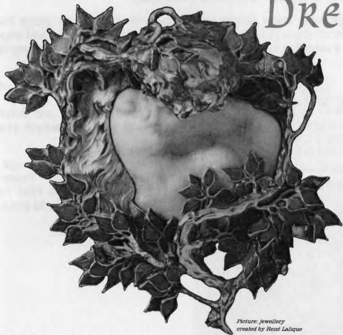
Picture: jewellery created by René Lalique

Monday April 23 Tuesday April 24 Wednesday April 25 Thursday April 26